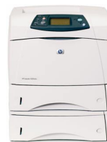
HP LaserJet 4350dtn printer