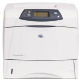
HP LaserJet 4350n printer