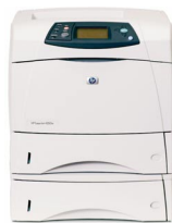
HP LaserJet 4350tn printer