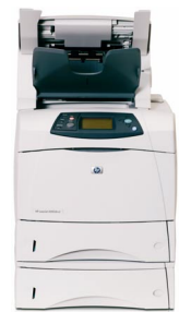
HP LaserJet 4350dtnsl printer